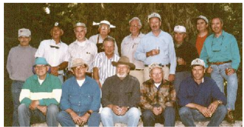
Past President's gather at the 1993 Gold Lake outing

It is my hope that this book, along with the enclosed documents, will serve as a permanent record and a thank you to those responsible for the organizations we enjoy today. One drawback in compiling a work such as this is that I may not have mentioned someone. I would like to mention the names of a few people, other than members of the McKenzie Flyfishers, who contributed substantially to the Federation of Fly Fishers that we enjoy today.